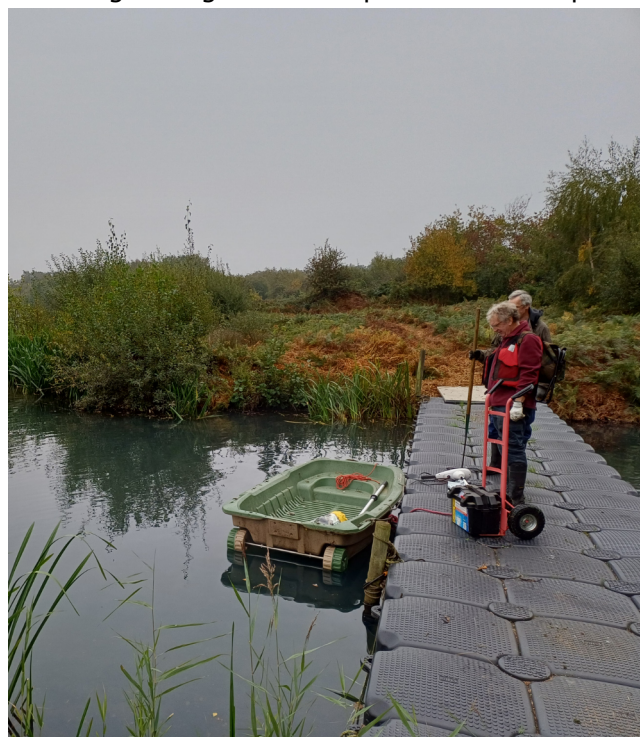
Who put that there?

Bramble, bracken and reeds were also cleared, dead hedges built and a large amount of brash neatly stacked in the Colebrook Cut that runs through Long Island to provide access points