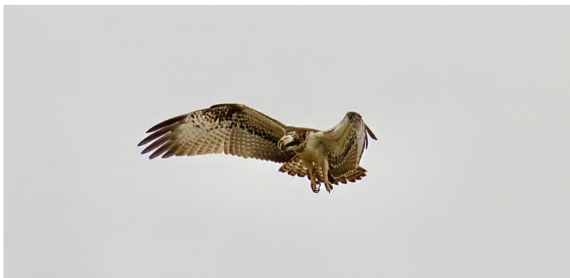
Osprey hovering over West Fen on 12 th September 2025

MGLG member Nic Beards found himself in the right place with his camera to capture this edition's wonderful cover photograph of the Osprey over the reserve.