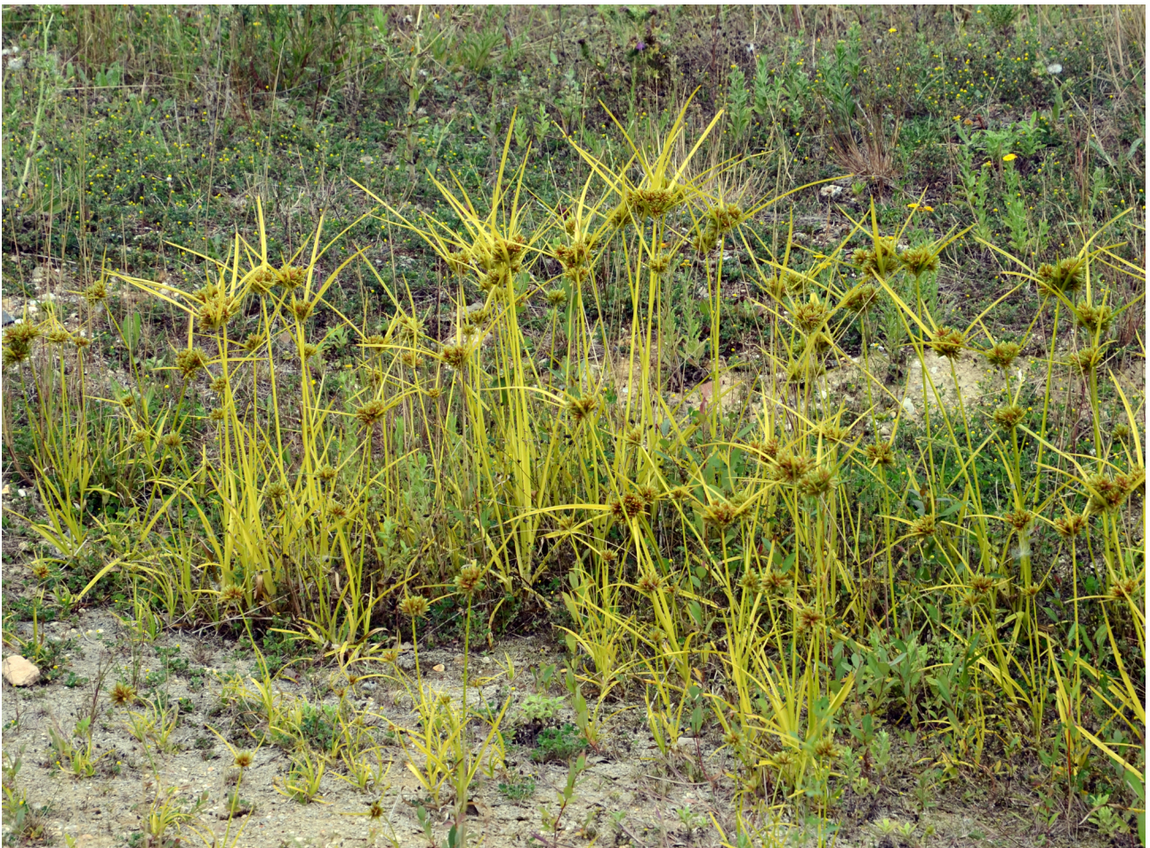
Above Wild Carrot flower head, below Galingale.