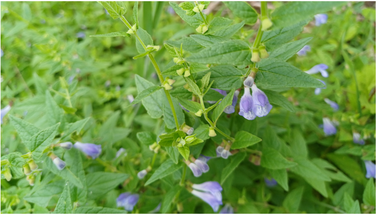
Skullcap. © Jane Heritage