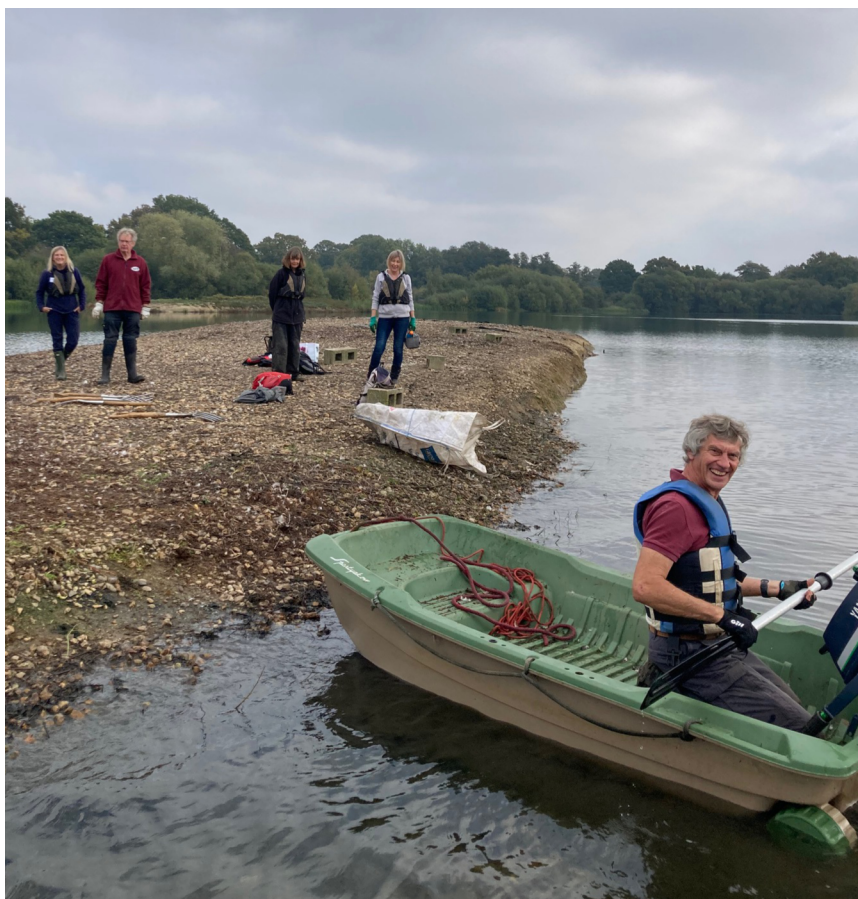
Ready to leave Tern Island

Note: A scrape is a shallow excavated pool that provides habitat for feeding wading birds or just an area for birds to get out of the water and relax called 'loafing'.