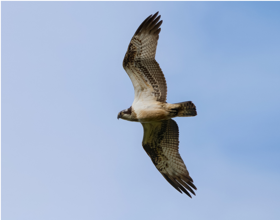
Osprey - Pandion haliaetus - seen over the reserve. See page 2 © Nic Beards