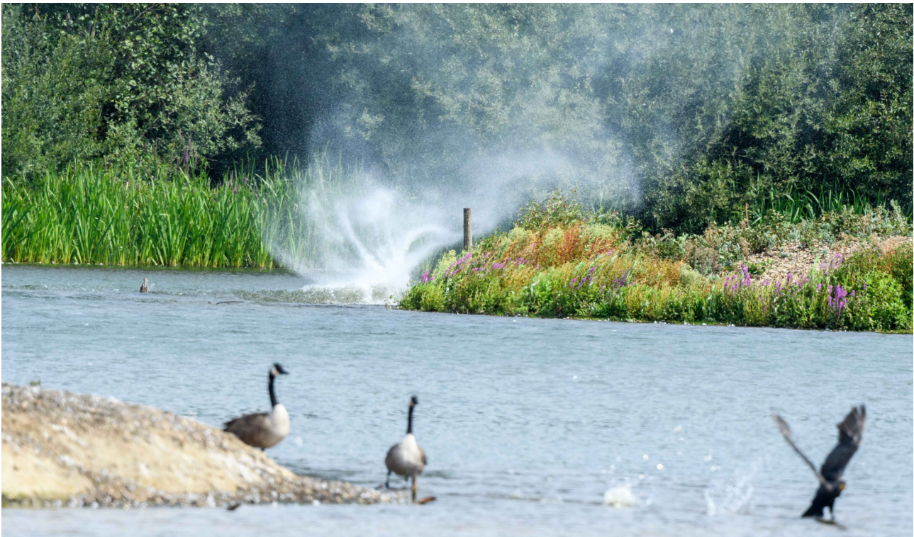
The water spout continues its journey.

drifted downwind – a willy willy that became visible through picking up water rather than dust. What had triggered this unusual phenomenon?