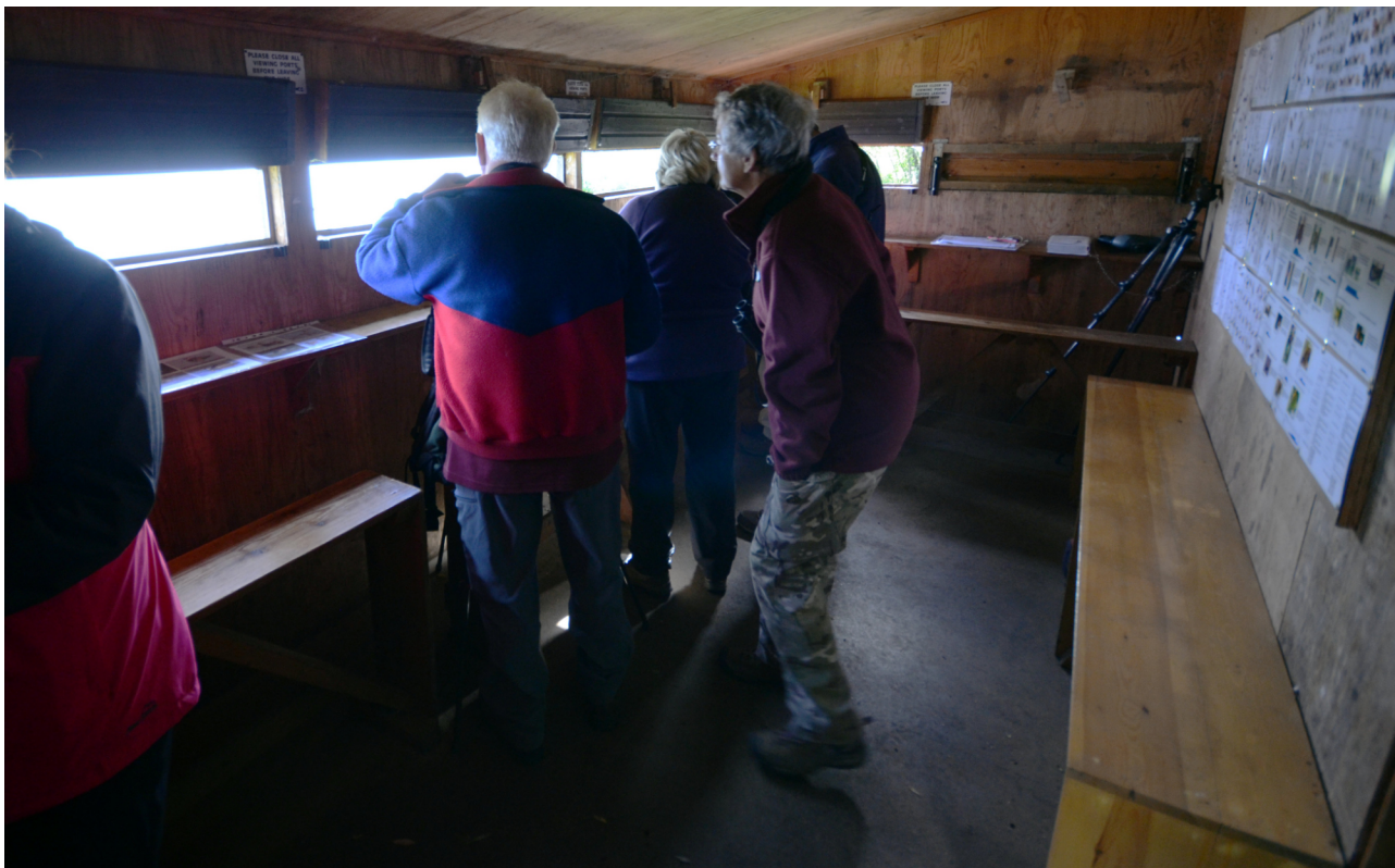
Inside the hide before the rush

Early in the day, Peter located a Snipe hunkered down in the reeds near the rail in front of the hide, conveniently marked by a feather blowing in the wind close by. Handy when you are trying to give the location of a well camouflaged bird to both birders and non-birders. Snipe are