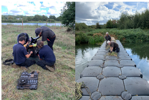
Tinkering with the mower and weeding the pontoon.