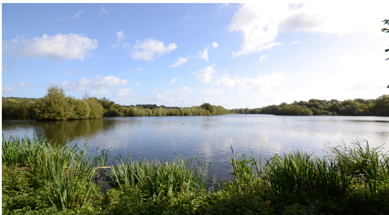
Colebrook Lake South on the open hide day.