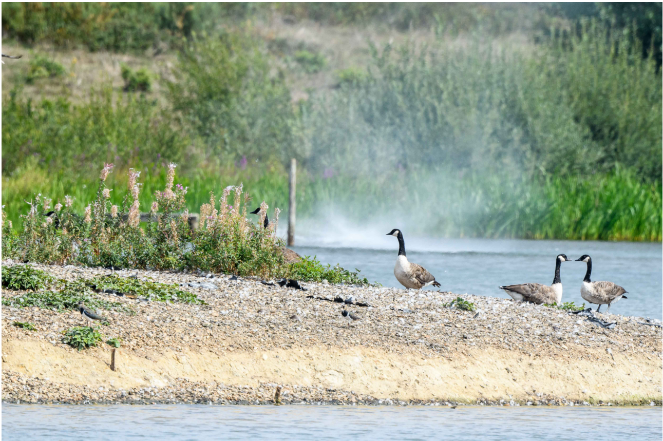
Water spout on Colebrook North Lake.

The most dramatic visual appearance of this event was the spinning funnel of spray; however, the initial disturbance of the trees on the north shore suggested an origin over the land. A likely explanation was what we saw was the result of a strong thermal updraft that developed a rapid rotation as it ascended and