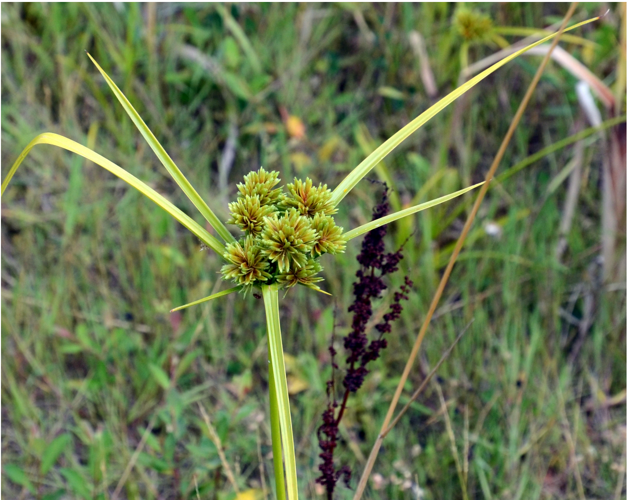
Above Galingale close up below Toadflax